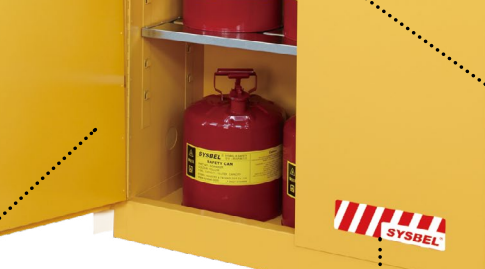
FM Approved Anti-Static Device:Conductor grip combine the equipment with the cabinet to conduct the static to earth, thus to prevent fire accident